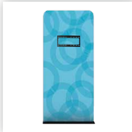
Reattach Monitor Bracket To Front Of Graphics And Tighten