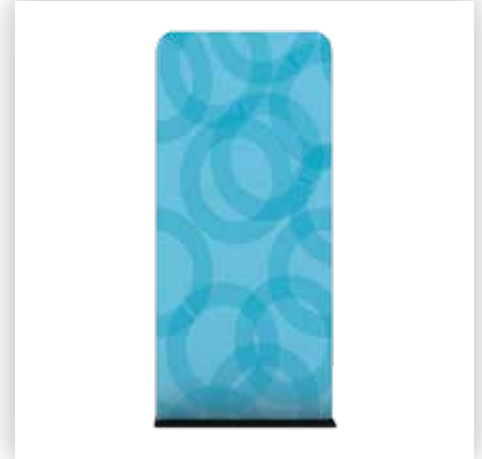
Put Graphic On The Frame