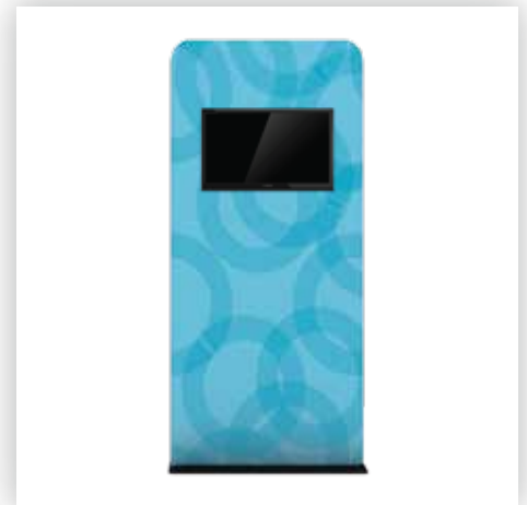
Attach Mounting Rails Onto Back Of Monitor