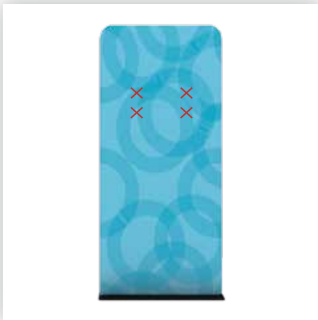
Make Slits With A Sharp Knife Where The Bolts Should Penetrate Graphic