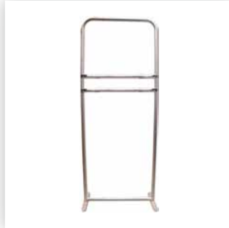
Once Marked With Marker, Remove Monitor Bracket